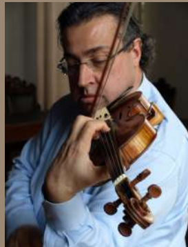
Dynamic www.lucafanfoni.it https://www.facebook.com/www.lucafanfoni.it